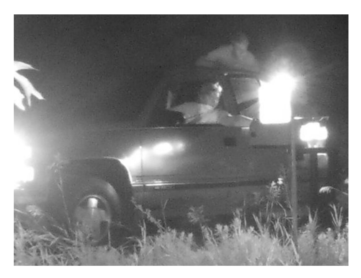
WEEK OF JUNE 23, 2014