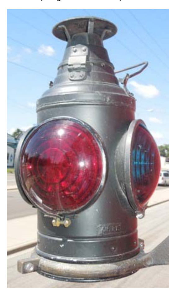
WEEK OF APRIL 14, 2014

In Sept 2013 railroad lights were stolen off of the STARail Legacy Museum on 3rd St N in Waite Park. The lights were connected to the outside of the railcar on display. See the picture below.