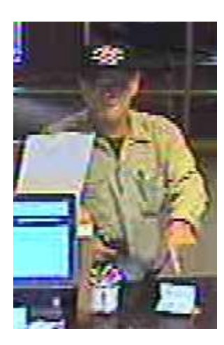
WEEK OF JULY 1, 2013

Anyone with information on this male suspect is asked to contact the Saint Cloud Police Department at (320) 251-1200 or Tri-County Crime Stoppers at (320) 255-1301. The Saint Cloud Police Department is working with the local Federal Bureau of Investigation (FBI) Office to investigate this matter.