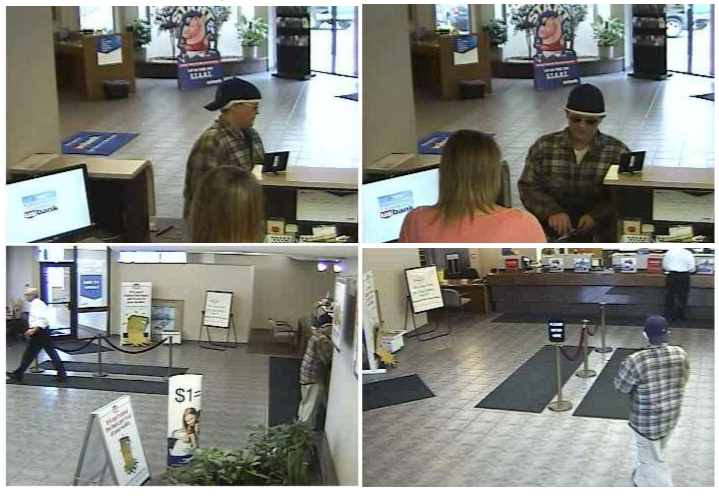
On 05/17/12 at approximately 1345 hours officers were dispatched to the U.S. Bank in the 10 block of 33rd Avenue North for a robbery.

A lone female described as 30 to 40 years of age, 5'5" to 5'8", approximately 150 pounds, and wearing baggy clothes displayed a note to bank employees implying she had a weapon. An undisclosed amount of cash was given to the female who left walking northbound on 33rd Avenue North.