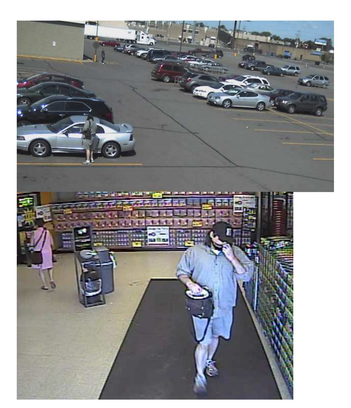
On 07/08/2012 at 1056 Hours Waite Park officers responded to a bank alarm at a branch bank of MidCountry Bank located at 113 Waite Ave South in Waite Park.

Upon arrival officers determined that the suspect confronted employees inside the branch and demanded cash. The employees complied with demands and the suspect exited the branch. The employees were not injured. Suspect fled with an undisclosed amount of cash.