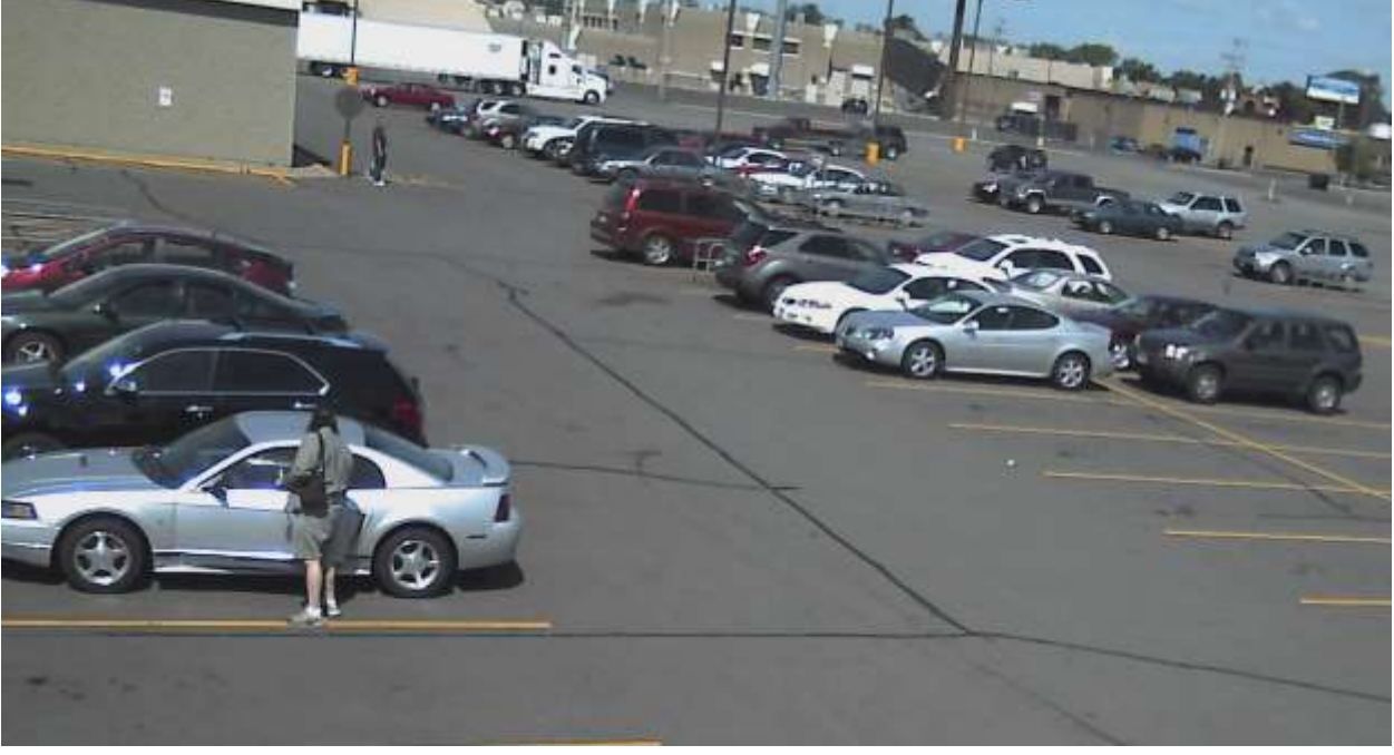
On 07/08/2012 at 1056 Hours Waite Park officers responded to a bank alarm at a branch bank of MidCountry Bank located at 113 Waite Ave South in Waite Park.

Upon arrival officers determined that the suspect confronted employees inside the branch and demanded cash. The employees complied with demands and the suspect exited the branch. The employees were not injured. Suspect fled with an undisclosed amount of cash.